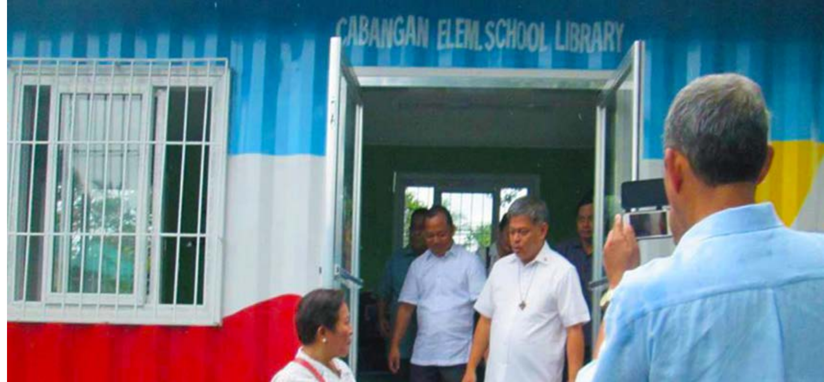
EGF in partnership with the US Peace Corps, USAID, IBM, and the Rotary Club of Paranaque Metro South donated its first disaster-resilient container van library to Cabangang Elementary School in Camalig, Albay on 28 June 2014. DepEd Secretary Bro. Armin Luistro, FSC visited the library last 03 July 2014.